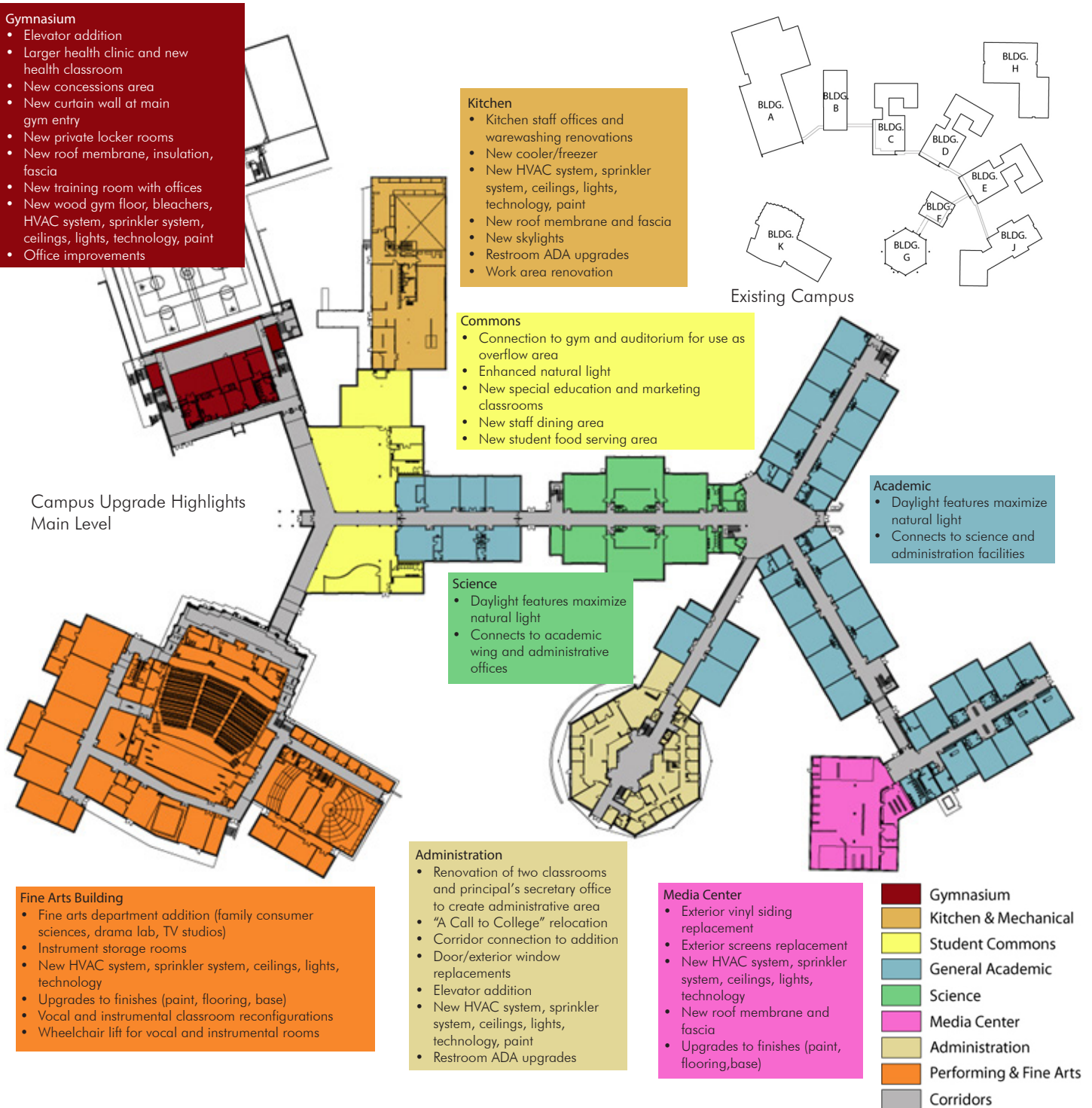
Campus Upgrade Highlights Main Level